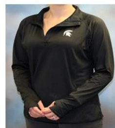
Ladies ¼ Zip – Black Only