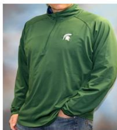
Men's ¼ Zip – Green only