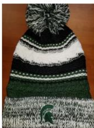
Beanie w/Sparty Helmet